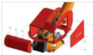
Intelligent casing design for effective heat protection and reliable operation.